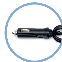
Cigarette Lighter Adapter