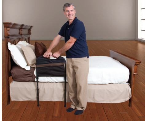
EASILY STAND UP