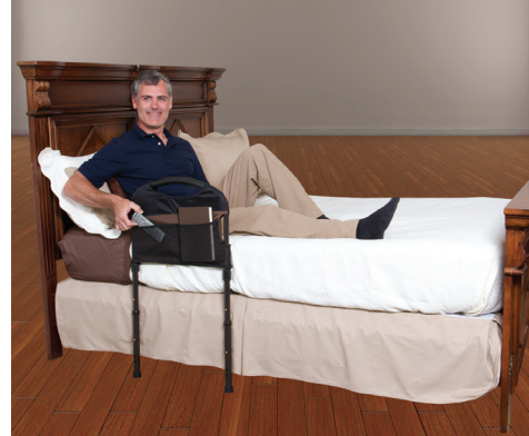
ORGANIZER KEEPS ITEMS CLOSE BY