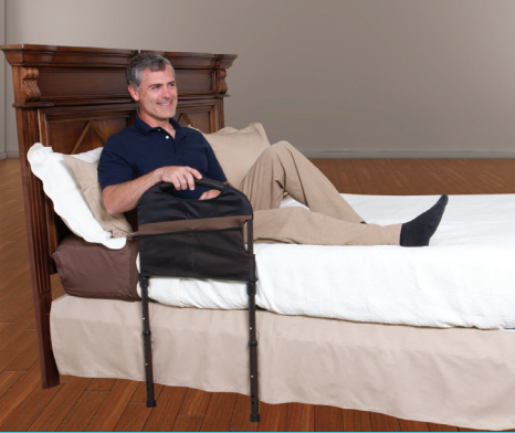
EASILY SIT UP IN BED