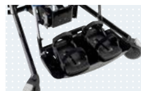
• Sandals, including straps. Sandal raiser (single, not shown)