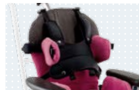
• Trunk harness (black)