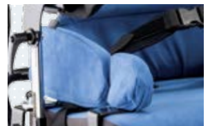
• Hip guides and adduction pad with covers