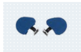
• Basic chest laterals (cover included)