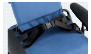
• Four-point pelvic harness