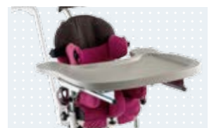
• Activity tray (grey)