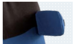
• Rigid PU chest laterals (cover included)