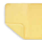
HCS (Hydrogel Colloidal Sheet)