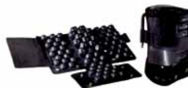
ROHO® HEAL PAD® Cushion