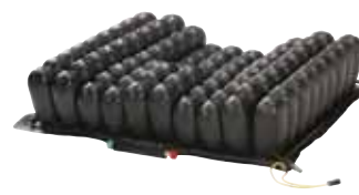
ROHO® CONTOUR SELECT® CUSHION