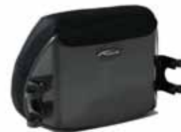
JetStream Pro® Back Support System