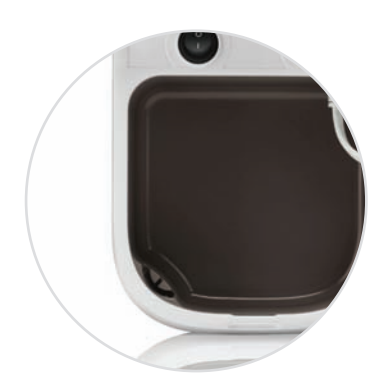
Nebulizer handset holder in integral storage area