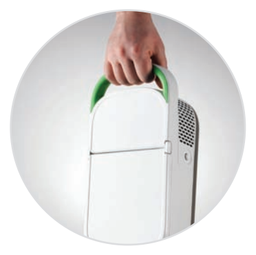
► Handle for easy transport

User manual languages available for InnoSpire Deluxe: