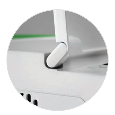
▶ Durable lid design with 180° hinge