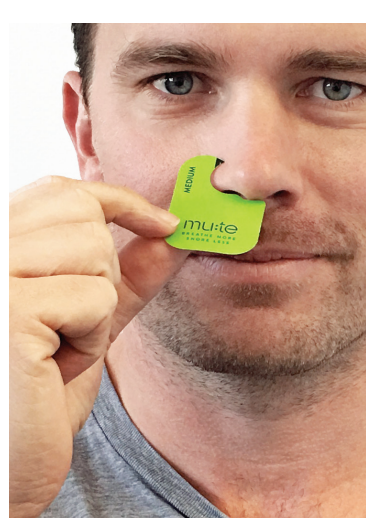
For a good fit, the black tip should be located at the crease line. In this example, Mute Medium would be the right size.

Then with the coloured side facing away from you, position the sizing tool under your nose.