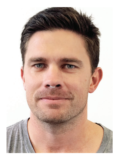
If the black tip is above the crease line, you are most likely Mute Small .

If below this crease line, you are most likely Mute Large .