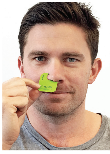
If you're unsure which size to start with, cut out the medium sizing guide.

TIP: Generally, as men are either medium or large and women are either small or medium, we recommend that you cut out the medium guide first.