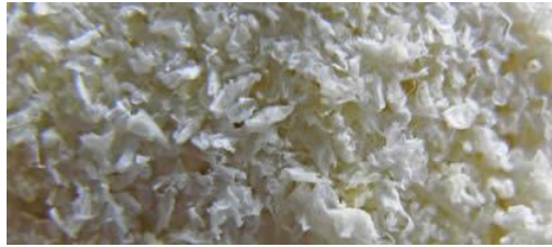
Close Up of CELOX Granules