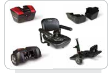
Go Chair® disassembly

Most Go-Go® Travel Mobility and Pride® Mid-Size Scooters feature Feather-Touch — one-hand disassembly for hassle-free transport and storage.