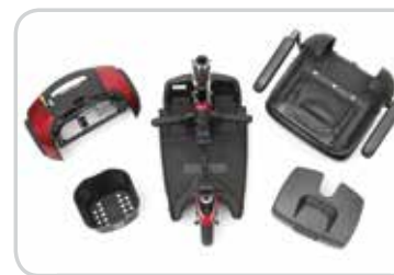
Scooter/travel mobility disassembly