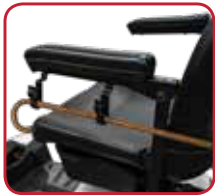
Cane clip attachment

A wide selection of Pride Mobility Scooter accessories are available to personalize your Pride Mobility Scooter to better meet your needs and make it uniquely yours.