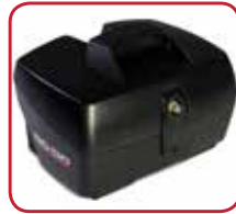
Additional battery box (18 amp)