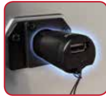
XLR USB charger