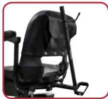
Wishbone crutch holder