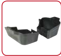
Under seat storage bins