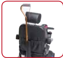
Single cane holder