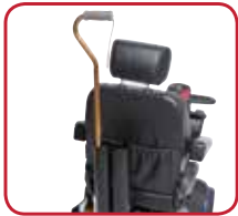
Double cane holder