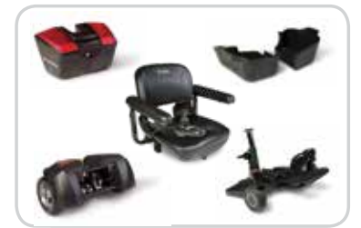
Go Chair® disassembly

Most Go-Go® Travel Mobility and Pride® Mid-Size Scooters feature Feather-Touch — one-hand disassembly for hassle-free transport and storage.