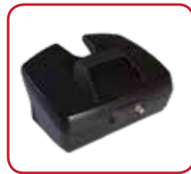
Additional battery box (12 amp)