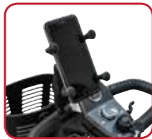
RAM® X-Grip® cell phone holder