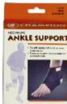
Figure-8 design conforms to the surface anatomy of ankle. Provides post cast/surgical support. Four-way stretch neoprene material provides even compression over joint prominences. Helps permit continued activity without binding or cutting.

Measure around the smallest part of the ankle. SMALL 6.0-8.0 in. MEDIUM 8.0-10.0 in. LARGE 10.0-12.0 in. X-LARGE 12.0-15.0 in.