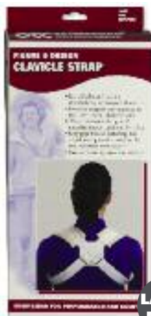
Figure 8 design clavicle strap Model: 2453 HCPCS: L3650

Holds the shoulder area in the correct position to help promote healing after a clavicular (collarbone) fracture or acromio-clavicular separation, among other indications. Can also be used to help correct simple bad posture. Figure 8 design for easy application; varying degrees of support can be obtained by adjusting the tension of the shoulder straps. Suitable for all figure types.