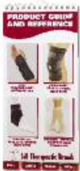
All-inclusive product guide

SAI's planogram layouts make it easier for you to merchandise, for your fitters to sell from, and for your more self-service clients to shop. Modular planogram components enable you to grow your business gradually, purchasing at your own pace, and getting most return for your investment. Choose between starter and intermediate assortments as well as brand specific assortments, depending on your business' particular needs and focus. (Shown above: planogram nos. 2020 and 4990.)