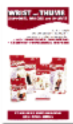
Wrist and thumb support education piece