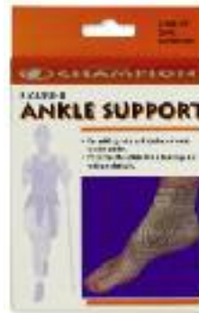
Figure 8 ankle support Model: C-60/45 HCPCS: A4466

Post cast/surgical support for weakened ankles. Figure-8 design conforms to the anatomy around the ankle joint. Elastic, cotton-rayon blend fabric provides firm support; helps improve circulation to promote healing. Fits easily inside shoes. Absorbs perspiration for all day wearing comfort.