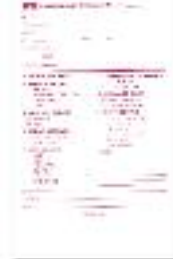
Orthopedic prescription pad