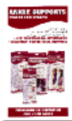
Ankle support education piece