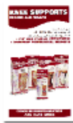
Knee support education piece