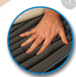
Durable, consistent performance High resiliency UHP 500™ foam layer provides a 55% higher Support Factor than typical medical grade foams.