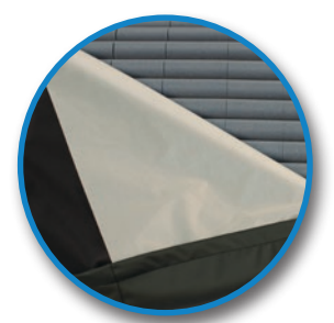
Shear Transfer Zone<sup>TM</sup> (STZ) Incorporated from Span-America's high-end support surfaces, STZ inside the top cover helps offset the effects of "microshearing" caused by small but continuous shifting on the surface.

A 30% larger surface area supports both limbs comfortably while not restricting patient movement. Dual-layer construction allows maximum immersion and won't bottom out.