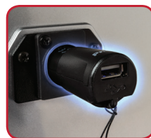
XLR USB charger