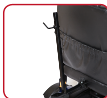
Wishbone crutch holder