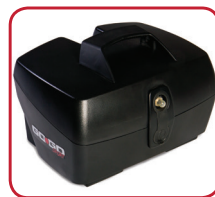
Additional battery box (18 amp)