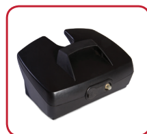
Additional battery box (12 amp)