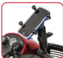
RAM® X-Grip® cell phone holder