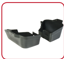
Under seat storage bins