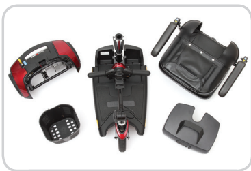
Scooter/travel mobility disassembly