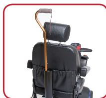
Single cane holder