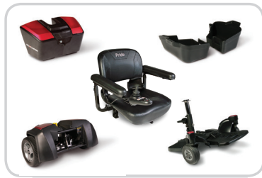
Go Chair® disassembly

Most Go-Go® Travel Mobility and Pride® Mid-Size Scooters feature Feather-Touch — one-hand disassembly for hassle-free transport and storage.