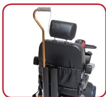
Double cane holder