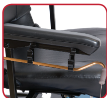
Cane clip attachment

A wide selection of Pride Mobility Scooter accessories are available to personalize your Pride Mobility Scooter to better meet your needs and make it uniquely yours.