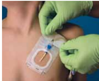
Pediatric Subclavian (SV254UDT)