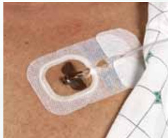
Implanted Port (SV254UDT)