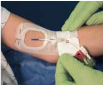
Pediatric PICC (SV254UDT)