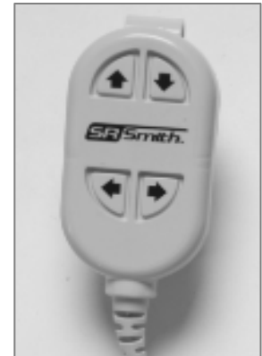
4-Button Hand Control

The Emergency Alert (audible and LED) can be activated by pressing any two buttons on the hand control at the same time (provided with the lift). This will stop all lift movement and activate the audible alert and the Red LED will flash. Once both buttons are released, the lift will return to normal operation and the emergency audible alert will silence.