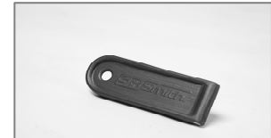
Activation Key (Option)

The Optional Activation Key provides a higher level of security by allowing control operation only with the use of the optional activation key. To enable operation slide the Access Key into the slot next to the touchpad control arrows. To disable operation remove the key. When the key is inserted or removed the Battery Level LED will illuminate for 10 seconds.