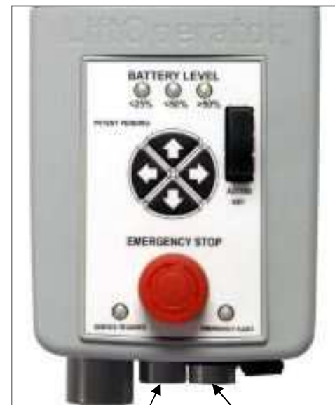
CONNECTOR 1 (MOTOR CABLE)

The Battery Level LED Indicators show battery charge levels. The LED's will illuminate when either the touchpad control or the hand control is activated and will stay lit for 10 seconds. At greater than 50% the LED glows Green, at less than 50% the LED glows Amber, and less than 25% the LED glows red and indicates the battery requires charging. If the less than 25% LED glows red, do not operate the lift. Remove the battery and fully charge before use.