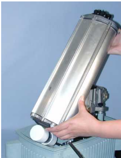
FIGURE AW: REMOVING THE SIEVE CANISTER