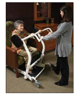
The user grasps the middle bar and uses their own strength to pull themselves up into position.

WARNING: Personal injury - this device is designed for transport assistance of individuals between approximately 5'1" and 6'6" (155 cm and 198 cm) in height. Ensure the LF1600 properly fits the individual being transferred before use.