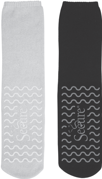
Available in seven colors: Black, Gray, Yellow, Red & Pink