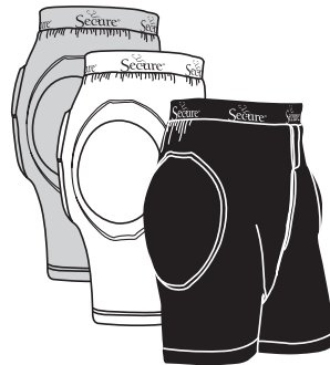
Secure ® Hip Protectors - SHP (In five sizes & 3 colors)