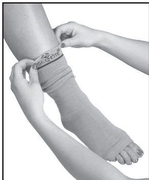
SecureSleeves ™ For Legs