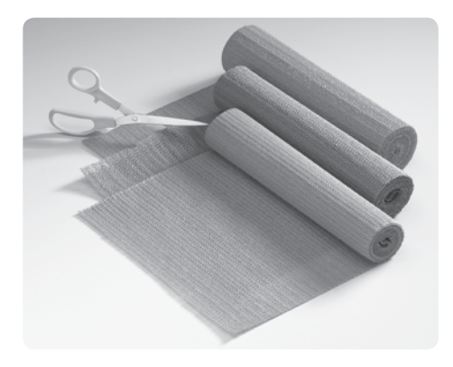
REF 6301 Green, REF 6301B Blue, REF 6301R Red

ACAUTION When using Posey Grip alone to prevent sliding, the resident's skin must be protected by clothing to prevent "shearing."