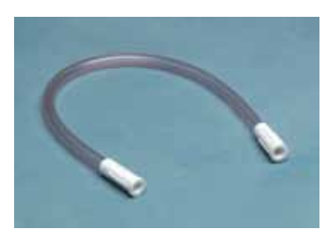
CRD™ and Guardian™ Tandem Tube