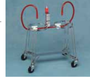
Metal roll stand with regulator hardware, double

Additional roll stands for Guardian™ Canisters. 1 each.