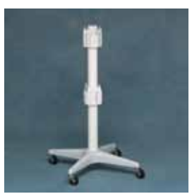
30 In. Eight-canister dual-head roll stand

Not compatible with 3000cc Flex Advantage® Canisters.