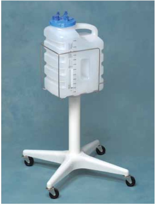
Canister and 18 in. roll stand