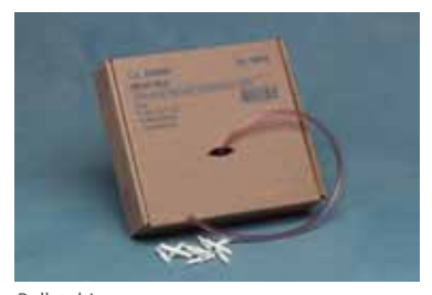
Bulk tubing 516500