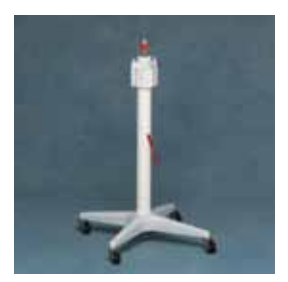
30 In. Roll stand with regulator mount