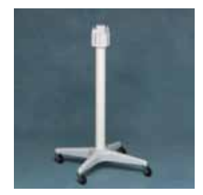
30 In. Roll stand

Roll stands allow flexibility in the location and configuration of Medi-Vac® Canister (CRD™, Flex Advantage® or Guardian™ Systems) installations.