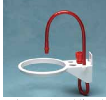
Guardian™ Ring Bracket Extended for Regulator (with D.I.S.S. and hose assembly)