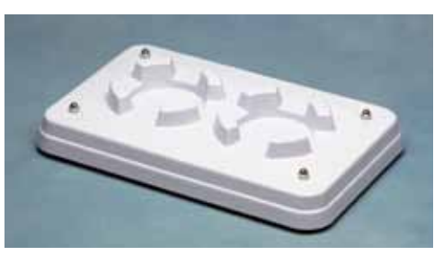
Double-canister roll stand