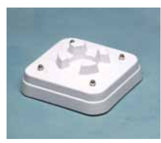
Single-canister roll stand