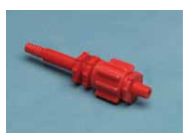
Universal female D.I.S.S.

Allow use with standard vacuum regulator Diameter Index Safety System (D.I.S.S.) connections.