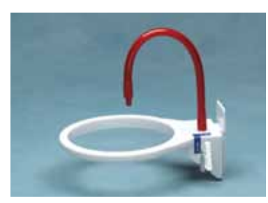
Guardian™ Ring Bracket with built-in on/off valve