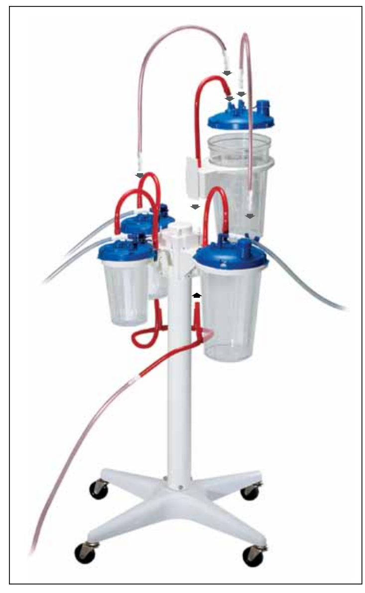
Multiple Guardian™ Canister assembly

This is a multiple Guardian™ Canister setup with two suction sites available. It has been arranged with two 1200cc Guardian™ Canisters in tandem and two 3000cc Guardian™ Canisters for 8400cc total collection capacity. Other configurations are available to meet your specific suctioning requirements.