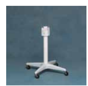
20 In. Roll stand