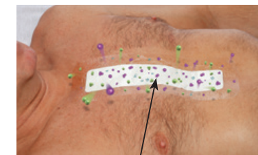
Tegaderm™ +Pad Dressings provide a viral* and bacterial barrier.