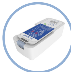
Inogen One ® G5 Extended Life Lithium Ion Battery** Up to 13 hours run time Item #BA-516