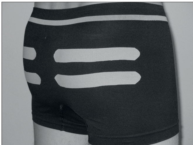
Fig. 5. Postero-lateral view of the neutral placebo KT application method (group B).

Subjects completed a standardised dynamic warm-up of 10 body-weight squats, lunge walks for 10 metres and buttock kicks for 10 metres. Thereafter each subject performed 5 CMJs at the Vertec at sub-maximal effort as training to decrease bias because of the learning effect. 27 Five practice jumps have been shown to adequately reduce the effect of learning on improvement of the outcome measure. 29