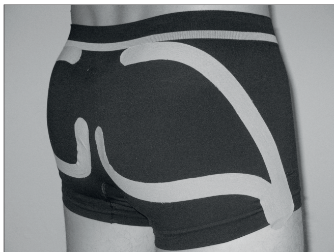
Fig. 3. Postero-lateral view of the Y-strip KT application method (group A).

wide were used. The tails of the Y were 30 cm long and 2.5 cm wide, leaving a base of 5 cm (the estimated distance between the subject's greater trochanter and fifth lumbar (L5) spinous process). Subjects were asked to lie on their sides with the hip in neutral alignment. The base of the kinesio tape was stabilised and the anterior tail nearest to the clinician was taped to the iliac crest with tape tension of between 50% and 75%. Subjects were then asked to flex, adduct and internally rotate the hip and flex the knee. The kinesio tape was stabilised and the posterior tail was attached to the sacral base, enclosing the gluteus maximus muscle, with the tape tension again between 75% and 100%.