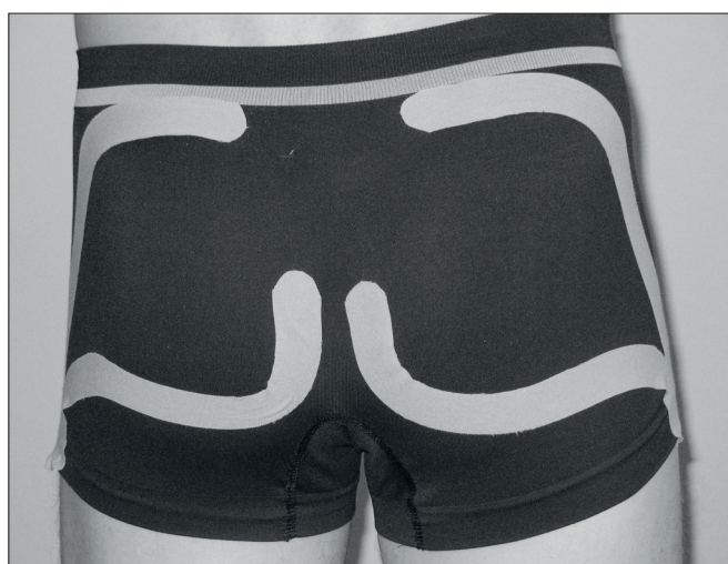
Fig. 2. Posterior view of the Y-strip KT application method (group A).

Kinesio tape was pre-cut and then individually tailored to each subject just before application. Group A's taping was applied bilaterally over the gluteus maximus muscle, as illustrated in Figs 2 and 3. The two Y-shaped pieces of taping of approximately 35 cm long and 5 cm