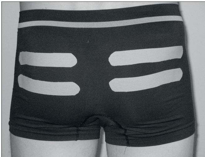
Fig. 4. Posterior view of the placebo I-strip placebo KT application method (group B).