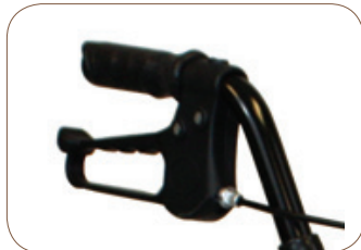
Locking Loop Style Brakes