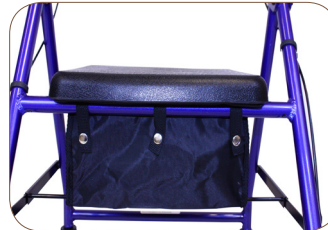
Flip-up Seat with Zippered Pouch