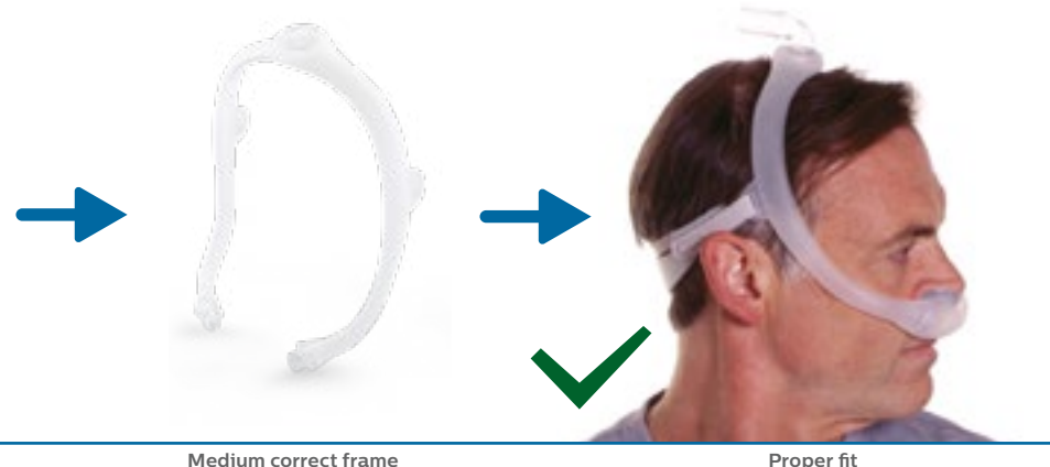
Medium correct frame

The medium mask frame will comfortably fit most faces. If the medium frame does not fit a patient's face, a small or large mask frame might better suit your patient's needs.