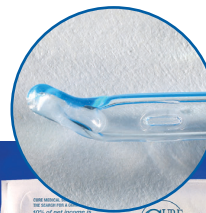
< Coude tip with a control stripe