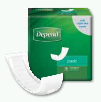
PADS Product Code: 4871 Capacity: 720ml