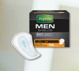
SHIELDS FOR MEN Product Code: 19069