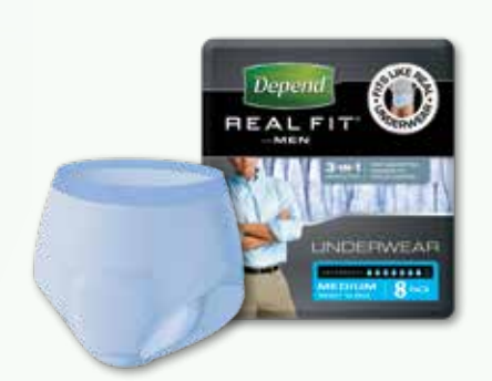
REAL FIT® UNDER-WEAR FOR MEN

Product Code: 19605 Size: Medium Capacity: 1320ml