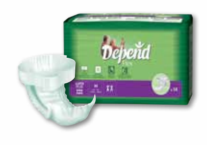
FLEX SUPER PLUS MEDIUM Product Code: 8741 Capacity: 2900ml