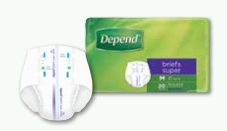
BRIEFS SUPER MEDIUM Product Code: 1737