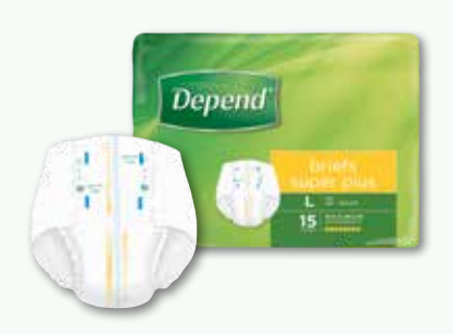
BRIEFS SUPER PLUS LARGE Product Code: 17390 Capacity: 4300ml