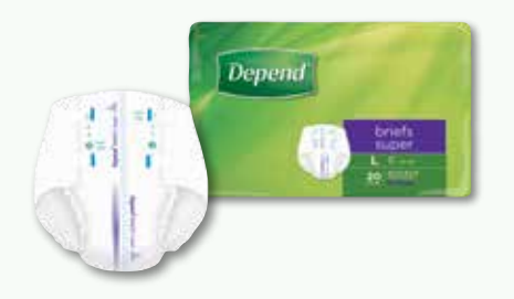
BRIEFS SUPER LARGE