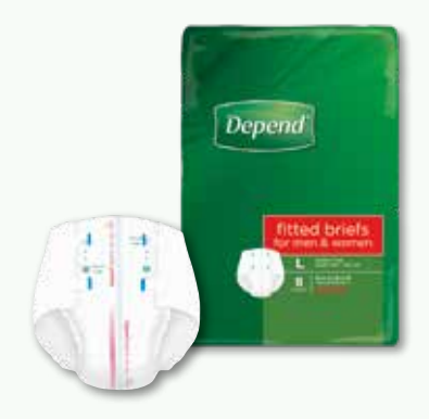
BRIEFS NORMAL LARGE