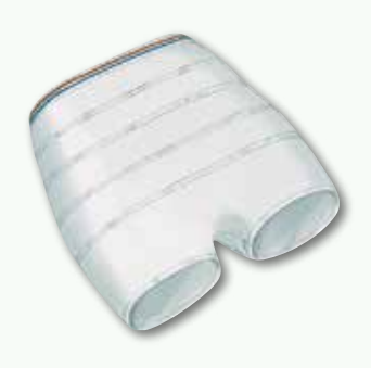
STRETCH PANTS L-XXL (85-160CM)

Product Code: 19800 Colour: Brown Stripe