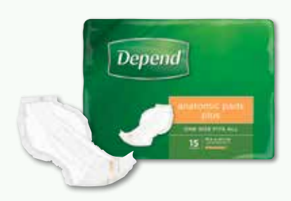
ANATOMIC PADS PLUS

Product Code: 19960 Colour: Purple Capacity: 2500ml