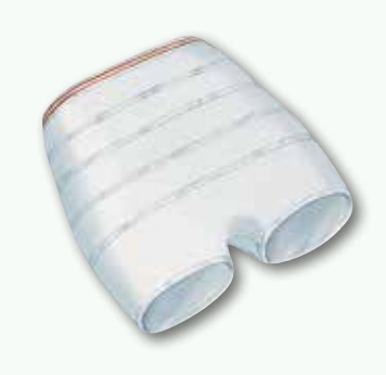
STRETCH PANTS M (65-95CM)

Product Code: 19970 Colour: Yellow Capacity: 3000ml