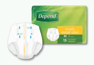
BRIEFS SUPER PLUS MEDIUM Product Code: 17410 Capacity: 3520ml