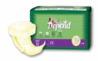
FLEX SUPER PLUS LARGE Product Code: 8739 Capacity: 3400ml

The DEPEND® Flex Super Plus range offers maximum protection for bladder and bowel incontinence with a breathable belt and secure re-fastening system, maximising air-flow around hips.