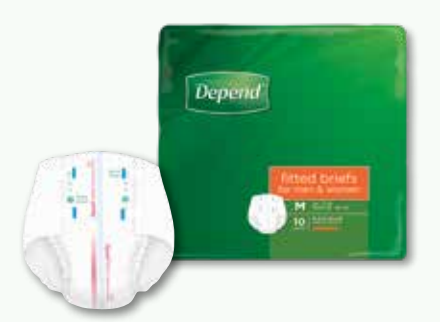
BRIEFS NORMAL MEDIUM