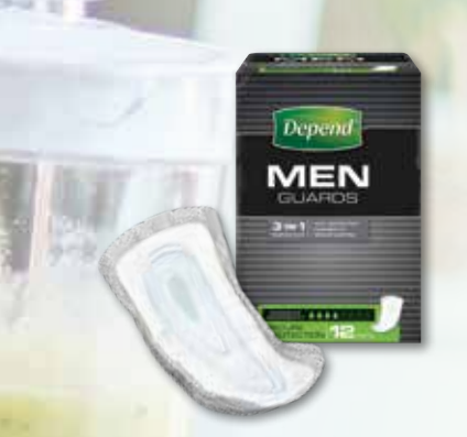
GUARDS FOR MEN Product Code: 19068 Capacity: 535ml

Product Code: 19605 Size: Medium Capacity: 1320ml