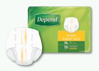
BRIEFS SUPER PLUS X-LARGE Product Code: 17400 Capacity: 4300ml