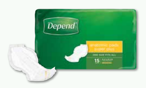
ANATOMIC PADS SUPER PLUS

Product Code: 19946 Colour: Orange Capacity: 1700ml