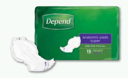
ANATOMIC PADS SUPER

Product Code: 19940 Colour: Pink Capacity: 1300ml