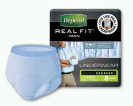
REAL FIT® UNDER-WEAR FOR MEN

Product Code: 19606 Size: Large Capacity: 1320ml