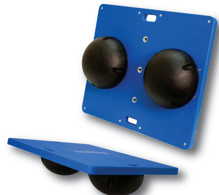
rocker board set-up