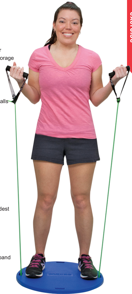
tie band or tubing in slots for dynamic exercise sold separately on pages 6-13

secure 2 balls to board for front/back and side/side rocker board