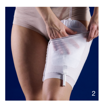
Place the leg bag in the pocket and pull the tap through the lower whole.