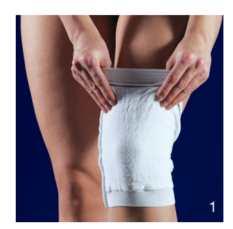
Pull on the leg bag holder (ensure the color size code is at the top).