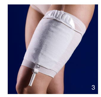
The CarePocket™ is in place.