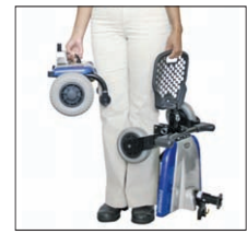
Extra light weight