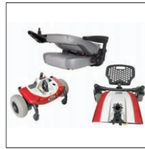
Connectorless technology for easy assembly