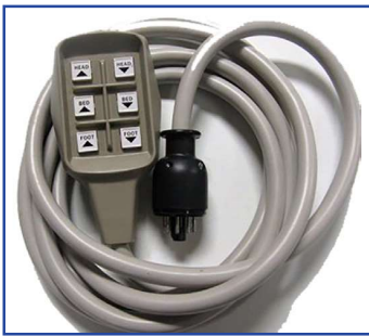
Electric Hospital Bed Power Cord

Electric Hospital Beds present a risk of self-injury to the psychiatric patient. Many psychiatric facilities have their own standards on the use of an electric bed, since suicidal patients can use the power cords as a way to cause harm to themselves and possibly to the caregiver. Limiting the number of electric beds in psychiatric facilities will help to prevent self-injury or suicide.