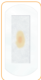
No change necessary