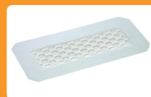
OPSITE Post-Op Visible