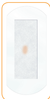
No change necessary

Fluid levels can vary so it's a good idea to keep check on how much fluid has been collected in the dressing. The transparent film makes this easy for you as you can see the fluid on the absorbent pad through the film.