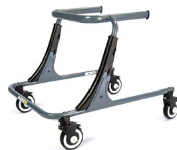
Sword Gray (available in Large Only)