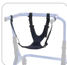
Soft Seat Harness