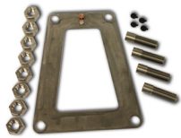
New Construction Jig with Anchors 500-5000A

Due to printing technology actual color may differ.