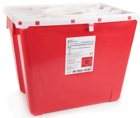
MFR # 2266