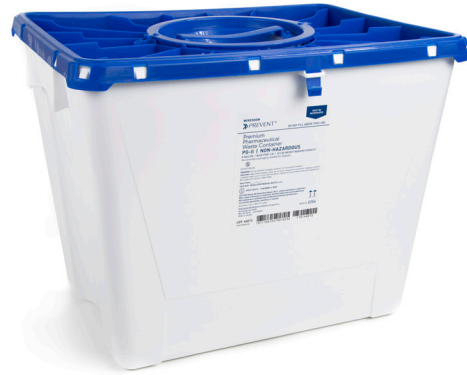
MFR # 2256