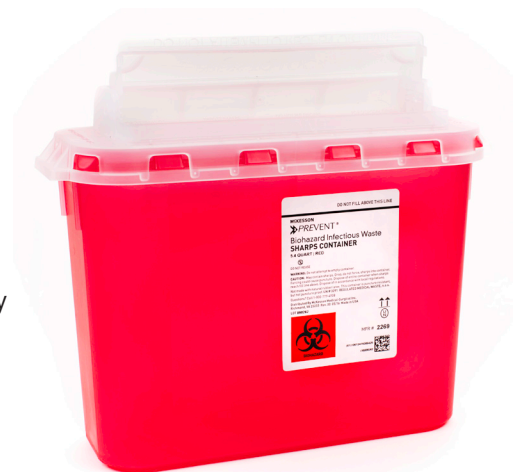
MFR # 2269