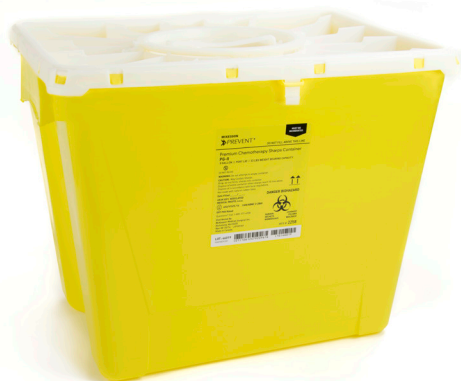
MFR # 2258