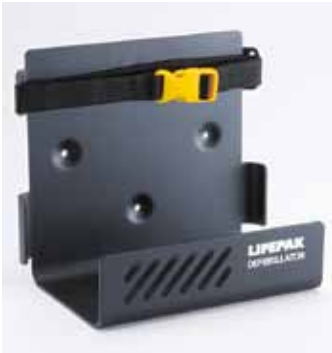
Wall Mount Bracket for LIFEPAK 1000 or LIFEPAK 500 Defibrillators 11210-000001