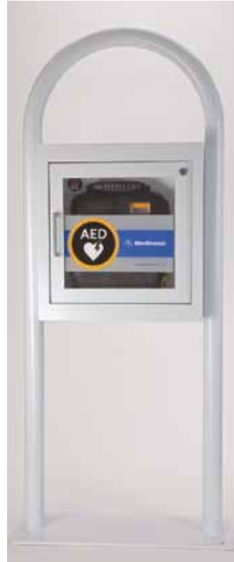
AED Floor Stand Cabinet with Alarm Works with LIFEPAK 500, LIFEPAK 1000, LIFEPAK CR Plus, or LIFEPAK EXPRESS defibrillators. White epoxy painted steel 52" tall, 14" x 17-3/8" high x 7" deep 11210-000028