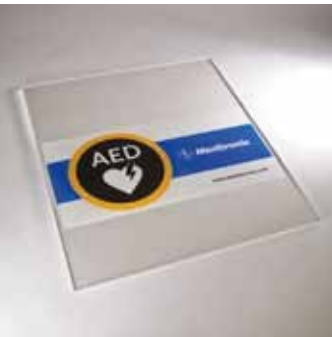
AED Cabinet Window Replacement Kit 21300-006797