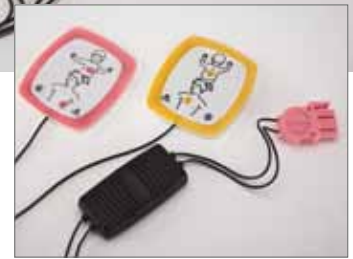
Infant/Child Reduced Energy Defibrillation Electrode Starter Kit

For use only with LIFEPAK® 500 Biphasic AED with pink connector or LIFEPAK 1000 defibrillator, LIFEPAK EXPRESS® AED, or LIFEPAK CR® Plus AED. For use on children less than 8 years of age or under 55 lbs.