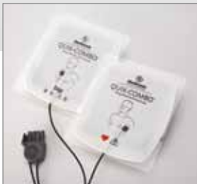
EDGE System™ Electrodes with QUIK-COMBO® Connector and REDI-PAK™ Preconnect System 11996-000017