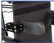
PR13574 Right Hand Swing-Away Adjustable Lateral