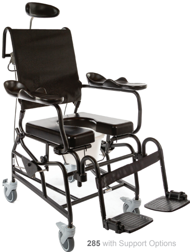
285 with Support Options