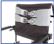
P11102 Bodypoint® Trunk Belt (pair)