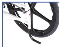
P13688 Bolted Axles with Tipping Levers (pair)