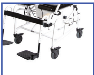
60800-2 5" Dual Locking Casters (pair)