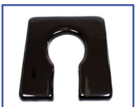
P13771 18"Wx20"D Ensolite® 1" foam Front Open Seat A-4.5"xB-7.5" opening