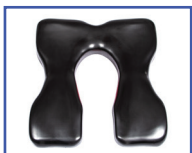
P60974 18"Wx18"D Comfortuff sloped foam Front Open Seat A-4"xB-6.5" opening