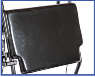
P11107 18"W Solid Back