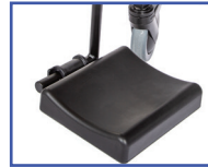
PR11101 Right Padded Foot Plate