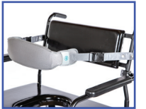
P11112 Bodypoint® XL Trunk Belt