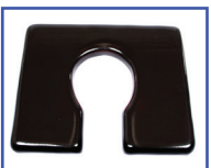
P60905 22"Wx18"D Ensolite® 1" foam Front/Rear Open Seat A-4.5"xB-7.75" opening