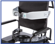
P11116 Bodypoint® Trunk Belt & Waist Belt