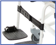
P60879 Calf Strap