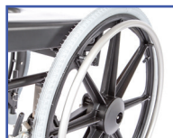
P61104 24" PVC Handrims (replaces standard handrims, pair)