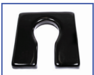
P60802 18"Wx18"D Ensolite® 1.25" foam Front Open Ring Seat A-4.5"xB-7.75" opening