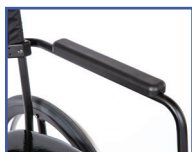
P13611 Left Hand Armrest with Pad