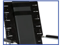
P11106 16"W Solid Back Full Length w/ Center Pad