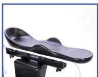
P13613 Left Hand Armrest with Arm Trough