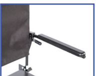
P13615 Left Hand Height-Adjustable Armrest