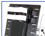
P11105 Head Support Small Foam (only available for P11104)