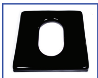
P13772 20"Wx20"D Ensolite® 1.5" foam Race Track Oval Seat A-7.75"xB-12.75" opening