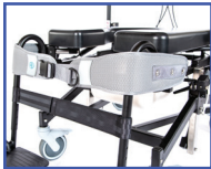
P11114 Bodypoint® Knee Belt