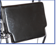
P11110 16"W Solid Back