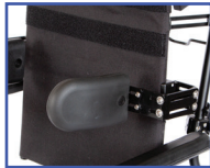
PL13574 Left Hand Swing-Away Adjustable Lateral