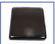
P61086 18"Wx18"D Ensolite® 2" foam Solid Seat