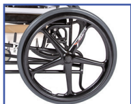
P61096 24" Wheels (pair)