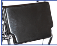
P11108 20"W Solid Back