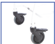
60800-2 5" Dual Locking Casters (pair)