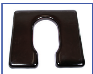
P13775 22"Wx20"D Ensolite® 1" waterfall foam Front/Rear Open Seat A-4.5"xB-7.75" opening