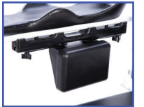
PR13618 Right Hand Arm-Mounted Hip Guide