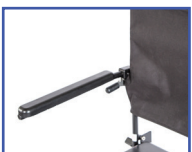
P13616 Right Hand Height-Adjustable Armrest