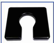
P61038 20"Wx18"D Comfortuff 1.5" waterfall foam Front Open Seat A-5"xB-8" opening