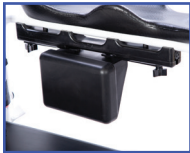
PL13618 Left Hand Arm-Mounted Hip Guide