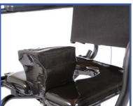
P61006 Abductor/Deflector Small