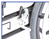
P60532 Wheel Locks (pair)