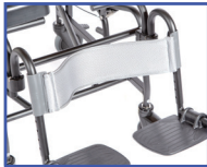
P61081 Bodypoint® Calf Strap