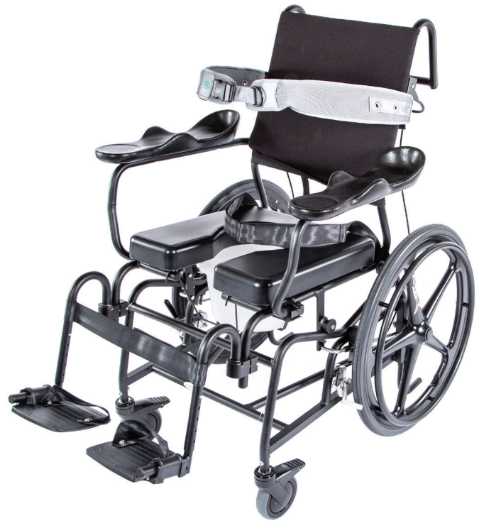
PKG207 Package #5 - 18"W x 18"D