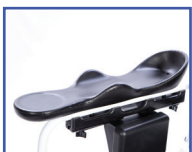
P13614 Right Hand Armrest with Arm Trough