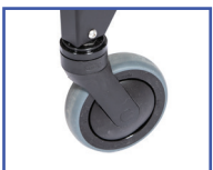
60841-2 5" Casters (pair)