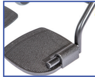
P61137 Left Oversized Aluminum Foot Plate