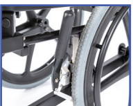
P13135 Wheel Locks with Extended Handle (pair)