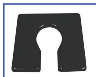
P60903 20"Wx18"D Ensolite® 1" foam Front/Rear Open Seat A-4.5"xB-7.75" opening