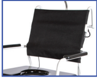
P60878 20"W Adjustable Sling Back