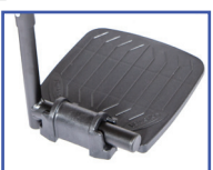
PR11099 Right Foot Plate