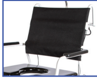
P61140 22"W Adjustable Sling Back