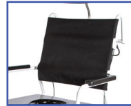
P61139 16"W Adjustable Sling Back