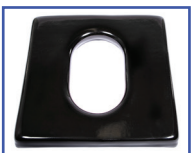
P13774 22"Wx20"D Ensolite® 1.5" foam Race Track Oval Seat A-7.75"xB-12.75" opening