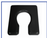
P61124 16"Wx18"D Ensolite® 1" foam Front/Rear Open Seat A-4.75"xB-7.75" opening