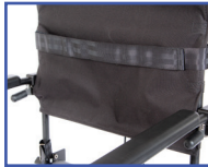
PT60910 Trunk Belt (48" circumference with 12" velcro overlap)