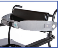
P11113 Belt w/Quick Release Knobs