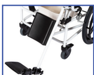
P13582 Left Elevating Leg Rest