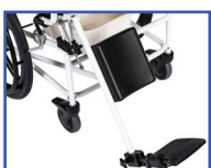
P13583 Right Elevating Leg Rest