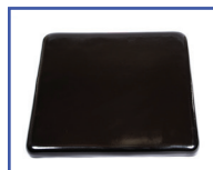
PP61122 20"Wx18"D Ensolite® 1" foam Solid Seat