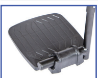
PL11099 Left Foot Plate