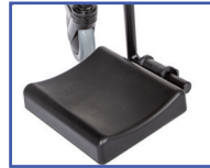
PL11101 Left Padded Foot Plate