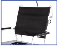
P60877 18"W Adjustable Sling Back