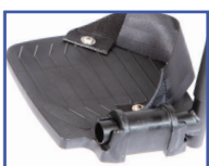
PL11100 Left Foot Plate with Heel Loop