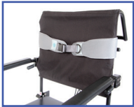
P11093 Bodypoint® Trunk Belt