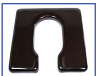
P13773 20"Wx20"D Ensolite® 1" waterfall foam Front/Rear Open Seat A-4.5"xB-7.75" opening