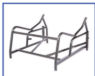
P13637 20"Wx18"D Stainless Steel Frame