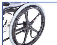
P61059 24" Flat Free Street Tread Wheels (pair)