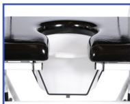
P13224 Pan/Hanger for Ring and Contoured Seats