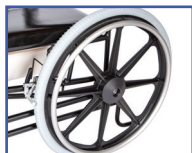
P60549 24" Pneumatic Street Tread Wheels (pair)