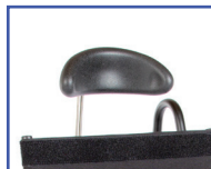
P13621 Head Support Large