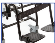
PR13581 Right Gooseneck Leg Rest