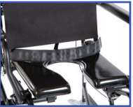
PW60884 Waist Belt (48" circumference with 12" velcro overlap)