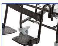
PL13581 Left Gooseneck Leg Rest