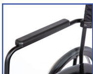
P13612 Right Hand Armrest with Pad