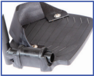
PR11100 Right Foot Plate with Heel Loop