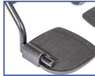
P61138 Right Oversized Aluminum Foot Plate