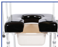
P13644 18"Wx18"D Pan/Hanger