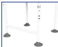
P13643 Legs w/Suction Tips (height seat range from floor to bottom frame-19.5"-22.5")