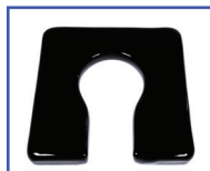
P60850* 18"Wx18"D Ensolite® 1" waterfall foam Front/Rear Open Seat A-5"xB-8" opening