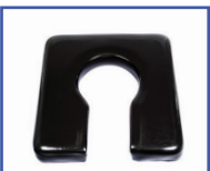
P60913* 18"Wx18"D Ensolite® 2" waterfall foam Front/Rear Open Seat A-5.25"xB-8" opening