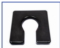
P60993* 18"Wx18"D Comfortuff 1.5" waterfall foam Front/Rear Open Seat A-5"xB-8" opening