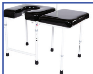
P13294 B-O Transfer Bench