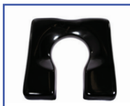
P61058 18"Wx18"D Ensolite® 2" waterfall foam Front Open Contoured Seat A-5.5"xB-8.25" opening