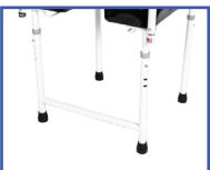
P13642 Legs w/Crutch Tips (height seat range from floor to bottom frame-19.5"-22.5")