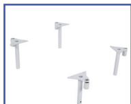
P13641 18"Wx18"D White Stainless Steel Frame