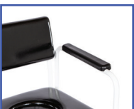
PL13291 Left Hand Armrest with Pad