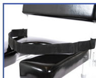
PW60908 Waist Belt (48" circumference with 12" velcro overlap)