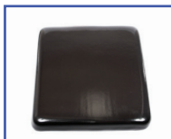
P61086* 18"Wx18"D Ensolite® 2" foam Solid Seat