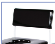
P13295 Back Tubes w/Solid Back Pad (13.5"H)