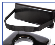
PT60908 Trunk Belt (48" circumference with 12" velcro overlap)