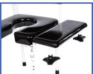
P13352 Short Transfer Bench