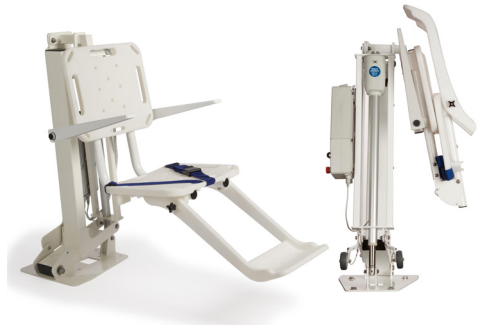
Optional folding seat assembly

A completed Deck Profile form is required with your pool lift order.