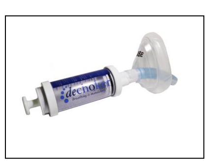
Figure 5. dechoker airway suction device.

It is a matter of perspective which of these three pressures would be the most relevant to the 35 kPa of vacuum force generated by the dechoker. However, it is noteworthy that the 35kPa of vacuum force generated by the dechoker is superior to all categories. It is also important to consider the current recommendations for suction devices in hospitals with regards to vacuum pressures used to remove foreign bodies or mucous. A setting of 12-16 kPa is typically advised,<sup>72</sup> with pressures of 10.6 - 13.3 kPa for those under 1 year of age and 13.3 - 20 kPa for adults being recommended.<sup>73</sup> In emergency departments and other advanced treatment facilities, suction pressures from wall mounts typically reach 26.6 kPa, and if full wall suction is needed in extreme cases, pressures as high as 84 kPa can be generated.<sup>74</sup> Figure 5 shows a picture of the dechoker device.