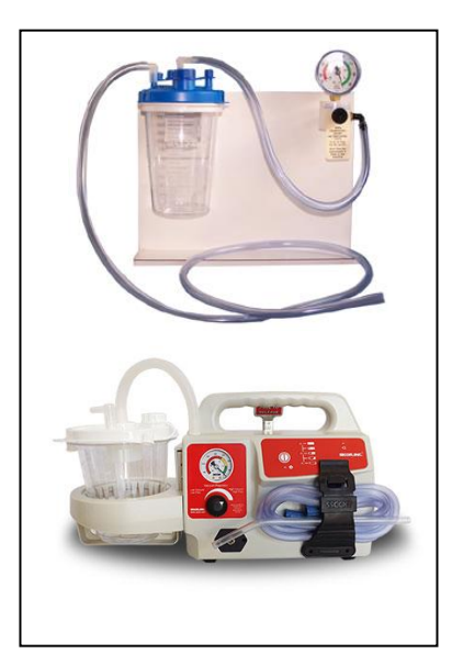
Figure 3. The Rico Model RS-4X (top) and SSCOR VX-2 Portable Suction.