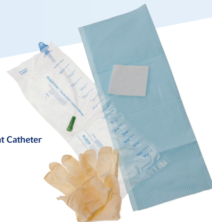
MMG™ Intermittent Catheter Closed System