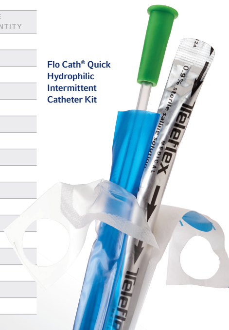
Flo Cath® Quick Hydrophilic Intermittent Catheter Kit