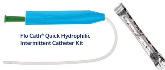
Flo Cath® Quick Hydrophilic Intermittent Catheter Kit