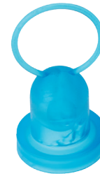
Rüscher® MMG H 2 O® Hydrophilic Intermittent Catheter Closed System

*Kits contain sterile gloves (not made with natural rubber latex), underpad, antiseptic skin prep, gauze and refuse bag for convenient disposal