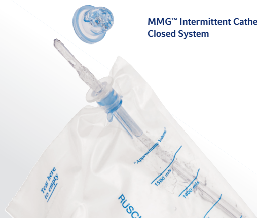
MMG™ Intermittent Catheter Closed System