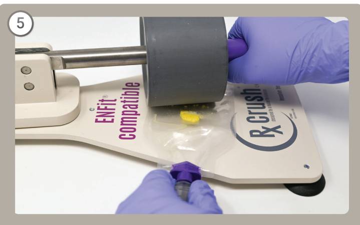
Move the pill pouch under roller and roll back and forth to pulverize pill. Syringe should be held to the side again.