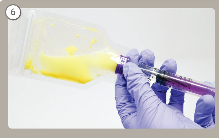
Remove syringe and pouch from the crusher. Inject water from syringe into pill pouch.