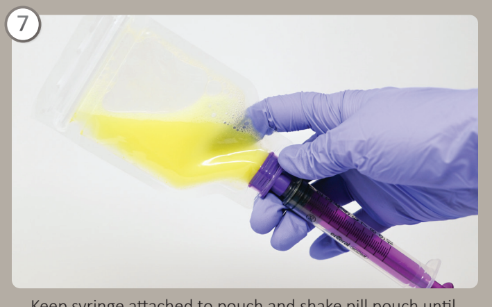
Keep syringe attached to pouch and shake pill pouch until medication is completely dissolved. Take the extra time to ensure it's completely mixed.