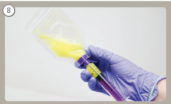
Draw dissolved solution from pill pouch into syringe. Hold pouch up and syringe down to ensure contents flow into syringe.