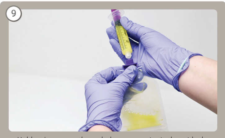
Hold syringe up and pouch down so contents do not leak. Detach syringe from pouch. Attach syringe to feeding tube and inject solution from syringe into feeding tube.