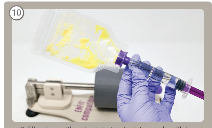
Refill syringe with water, inject water into pouch, withdraw contents and inject into feeding tube as many times as necessary to remove all pill particles from pill pouch.