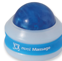
Omni® Roller Mini