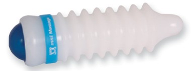
Omni® Multi Massager