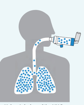
Using Inhaler with aVHC: Medication reaches lungs.