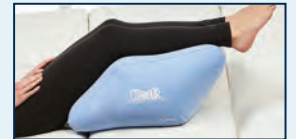
Legs Up Elevation