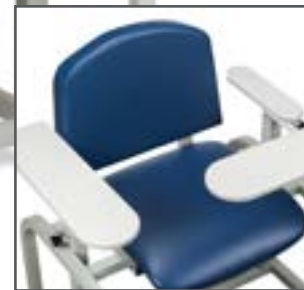
-665 ClintonClean™ Arms option