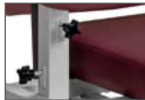
Armrests are adjusted by two star knobs