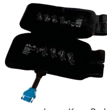
Large Knee Pad