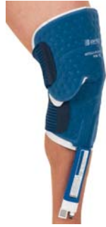
Intelli-Flo Knee Pad (13.5" x 14")