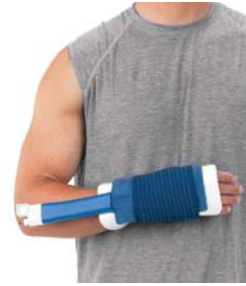
Shown on Hand Intelli-Flo 3x5 Pad (3" x 5")