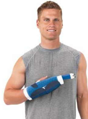
Hand / Wrist WrapOn Pad (8.5" x 9.75")