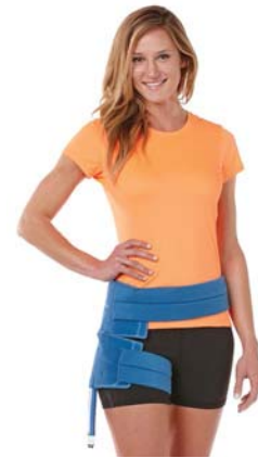
WrapOn Hip Pad (11.5" x 12") Long strap length = 44" Short strap length = 26"