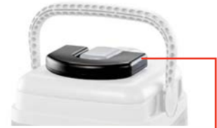
Polar Care Kodiak Battery Pack (optional)