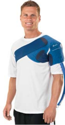
Shoulder WrapOn Pad (10.25" x 11.5") X-Large (13" x 21.5") (10" x 11.75")