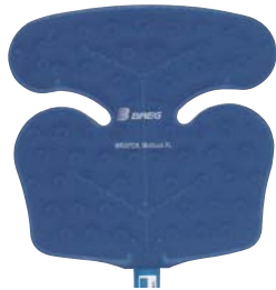
Multi-Use XL WrapOn Pad (11.25" x 11.25")

The WrapOn Polar Pads' ergonomic design provides exceptional coverage and patient comfort. Elastic straps offer static compression while holding the pad firmly in place. WrapOn Pads may be used with the Polar Care Glacier, Cube, and Cub only. Proper use requires an insulation barrier between the pad and the patient's skin. The water impermeable Sterile Polar Dressings offered by Breg provide a complete barrier between the pad and the patient's skin.