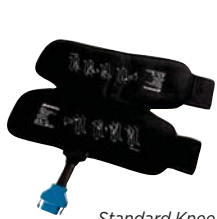
Standard Knee Pad