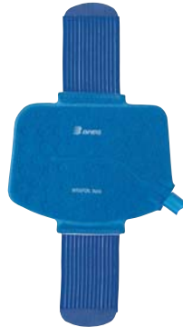
Back WrapOn Pad (8.25" x 11")