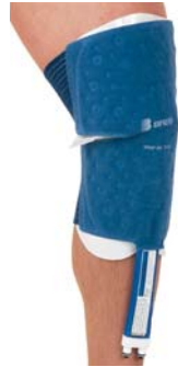
Knee WrapOn Pad (10.25" x 11.25") Large (11.5" x 12") XL (12.25" x 19")