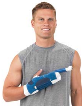
Intelli-Flo Hand / Wrist Pad (8.25" x 9.75")