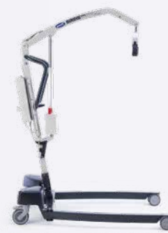
Birdie EVO XPLUS

Our premium model has an advanced control unit with service monitoring capabilities, protective covers and larger rear castors.