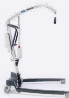
Birdie EVO PLUS

A smaller size allows the Birdie EVO COMPACT to easily operate in environments where space is limited.