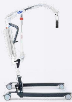
Birdie EVO COMPACT

A redesigned version of the market leading Birdie mobile floor lifter, designed to support safe transfers in both home-care and long-term-care environments.