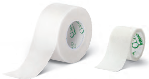
NON270101 1" x 10 yds Cloth "Silk" Tape