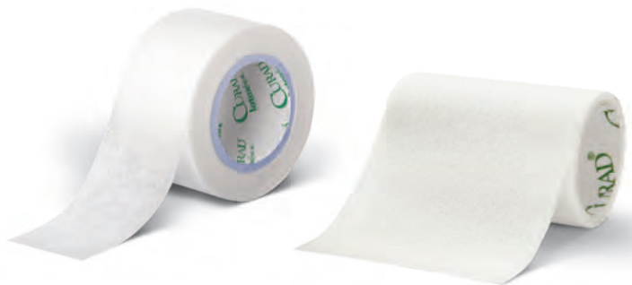
NON270001 1" x 10 yds Paper Tape