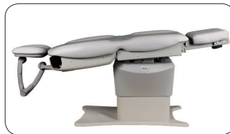
Left Lateral Plane